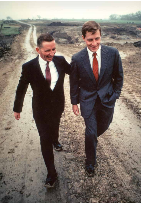
“The real estate business was something Dad and I could do together.” – Ross Perot, Jr.

Each Hillwood Communities endeavor is measured against five principles guiding the placemaking effort: sense of community , well-being , enrichment , stewardship , and innovation . For Pecan Square, that involved collaboration with local stakeholders and industry leaders to create a community with stellar amenities, a vibrant lifestyle program, and a healthier, smarter, more enjoyable place to live.